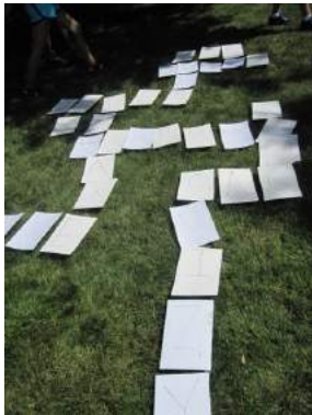
Left: The Discovery Campers played life-sized scrabble