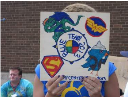
The Blue Team Plaque will be proudly displayed for all to see for years to come!