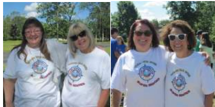
Below: Thank you to JCC Staff who took the to judge our Color War! And below that, Color War Captains!