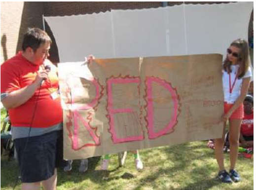
All the teams made banners to support and earn points for their teams!