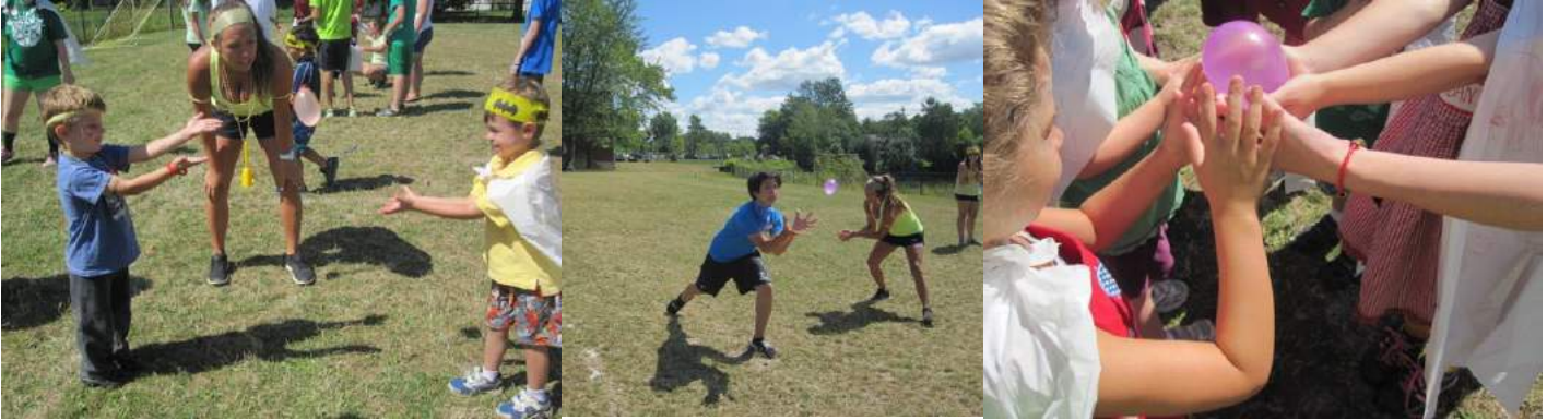
Top: How exactly do you toss a balloon? The judge showed us a not-yet popped one.