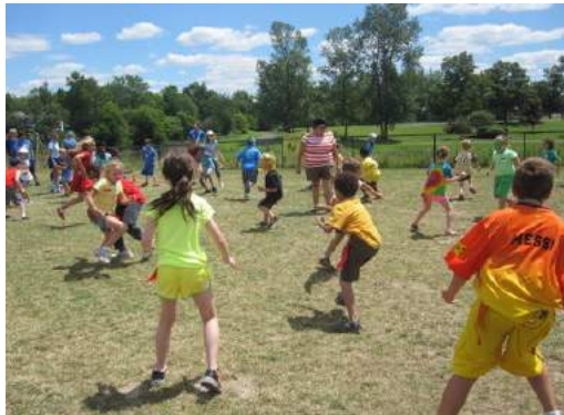
Right: Senior Camp played the best sock game Centerland has ever seen!