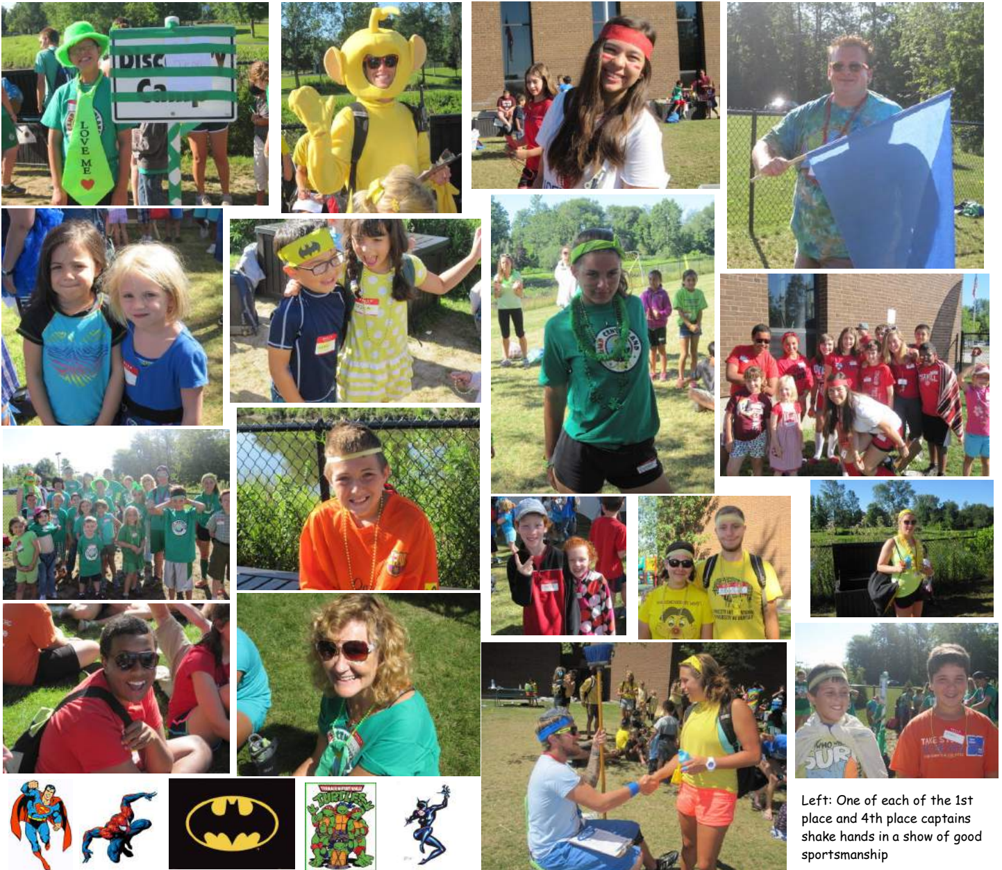
Left: One of each of the 1st place and 4th place captains shake hands in a show of good sportsmanship