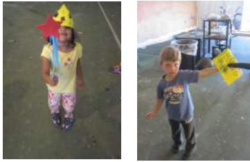
Above: A Princess and a Pirate from the Junior Camp Staylate

But the main highlight this week was Color War, or in Hebrew, Maccabiah. Our theme was Superheroes trying to defeat Catwoman. Superman, Spiderman, Batman, Wolverine, the Ninja Turtles, and