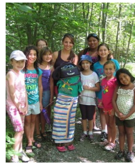
Yehuda Girls make a Camp Mascot