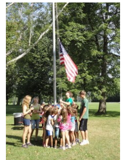
Raising the flag.