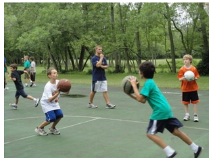
Atid show some skills on the basketball court