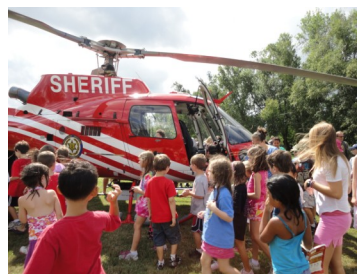
Checking out the helicopter!

We're all a bit sad since we know that the publication of the Week 7 edition of the Chronicle means there is only 1 week left at camp. Let's make the most of it!