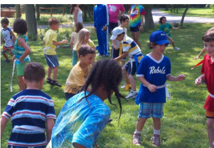
Color War battle of the Sock Game.