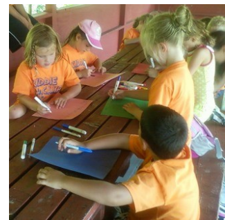
Kiddie Camp comes to visit Centerland!