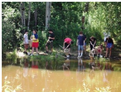
Discovery exploring nature on their weekly field trips.