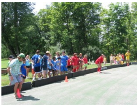
Teams compete at the game Mission Impossible during Color Wars Week 4

Thanks for another wonderful week campers and staff! Our summer wouldn't be amazing without all of you!