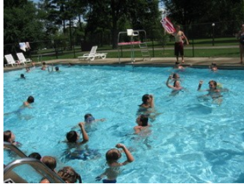
Campers treading water during Color Wars!

This week, the "Counselors in Training" finished their Red Cross First Aid and CPR training. The CITs are now proficient in how to assist someone who is choking, suffering a heart attack, or needs rescue. They also learned basic first aid skills.