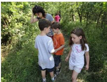
Sharon Campers go on a camouflage hunt during Teva 2.0.

ductions, who will be here every week taking group portraits and candid photographs of all of our campers. The 5x7 "Making Memories" Group Portraits are still available to order for $10 each. Contact Camp Centerland to place your order today!